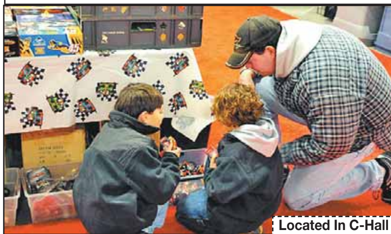
Located In C-Hall

$575 FOR FIRST 10' WIDE X 10' DEEP BOOTH $525 FOR EACH ADDITIONAL BOOTH SPACE